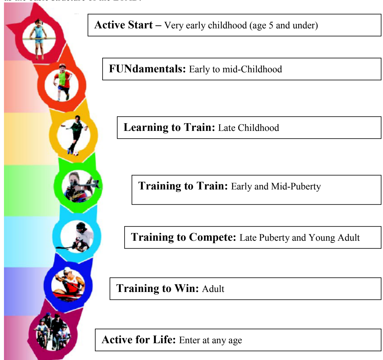
Table 1 provides an overview summary of the main recommendations provided by the Biathlon Canada Long Term Athlete Development Model (LTAD). Figure 2 below illustrates Balyi's Stages for late maturing endurance sports like Biathlon which is used as the basic structure of the LTAD.

Adapted from Canadian Sports Centre, 2007 and Biathlon Canada 2006